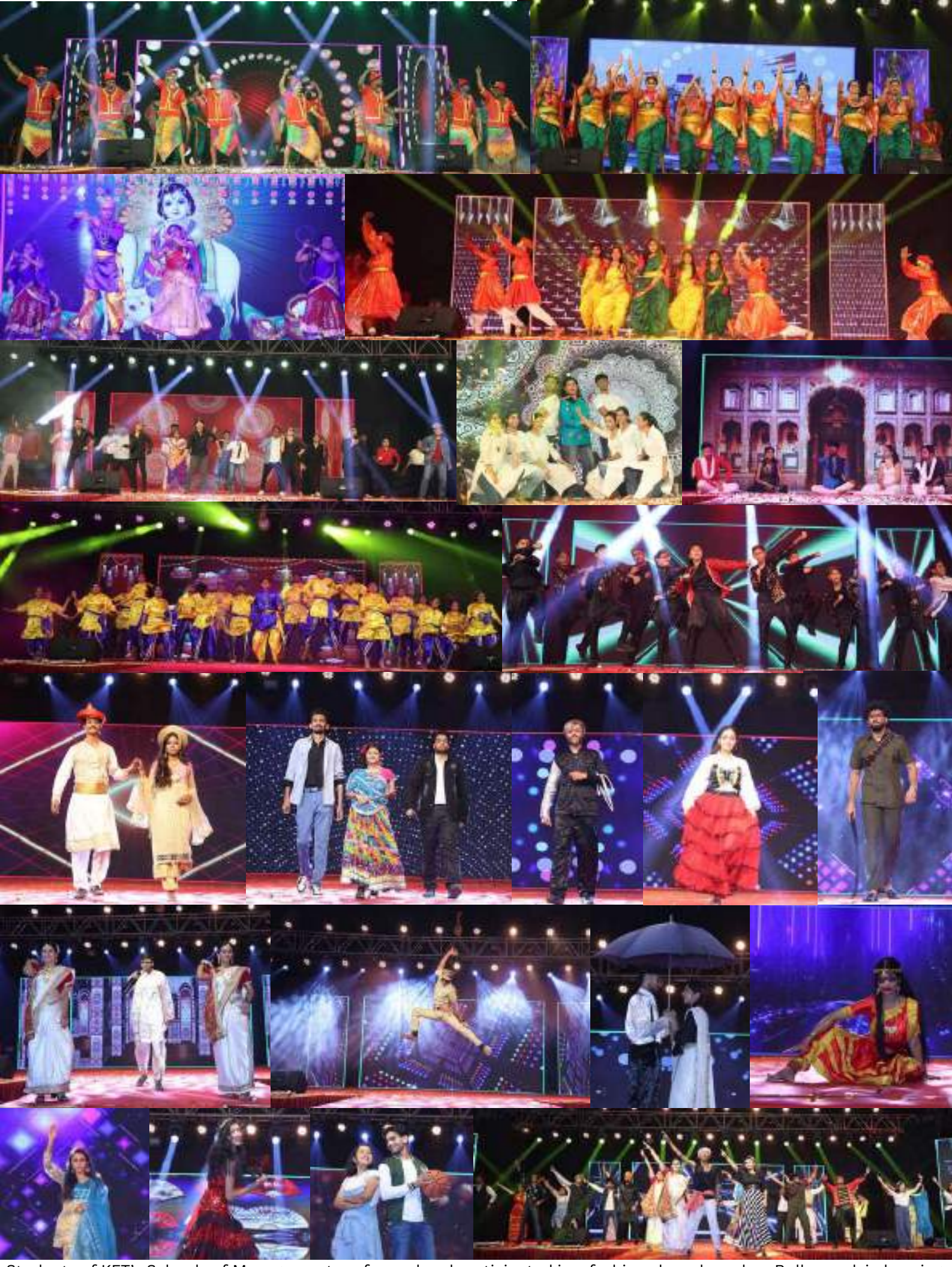
Students of KET's Schools of Management performed and participated in a fashion show, based on Bollywood, in keeping with the theme of the Cultural Evening - Mystical Mumbai. The performance that was a collage of diverse movies and genres, showcased the variety in Indian cinema. Kudos to the students for their stellar performances and to the KET team for giving the students a platform to showcase their talent!