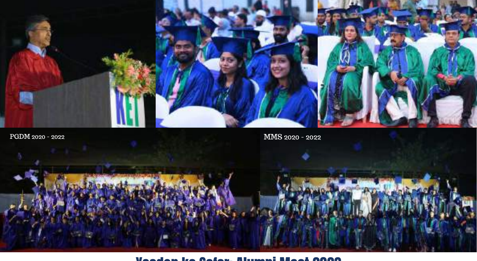
Yaadon ka Safar: Alumni Meet 2023