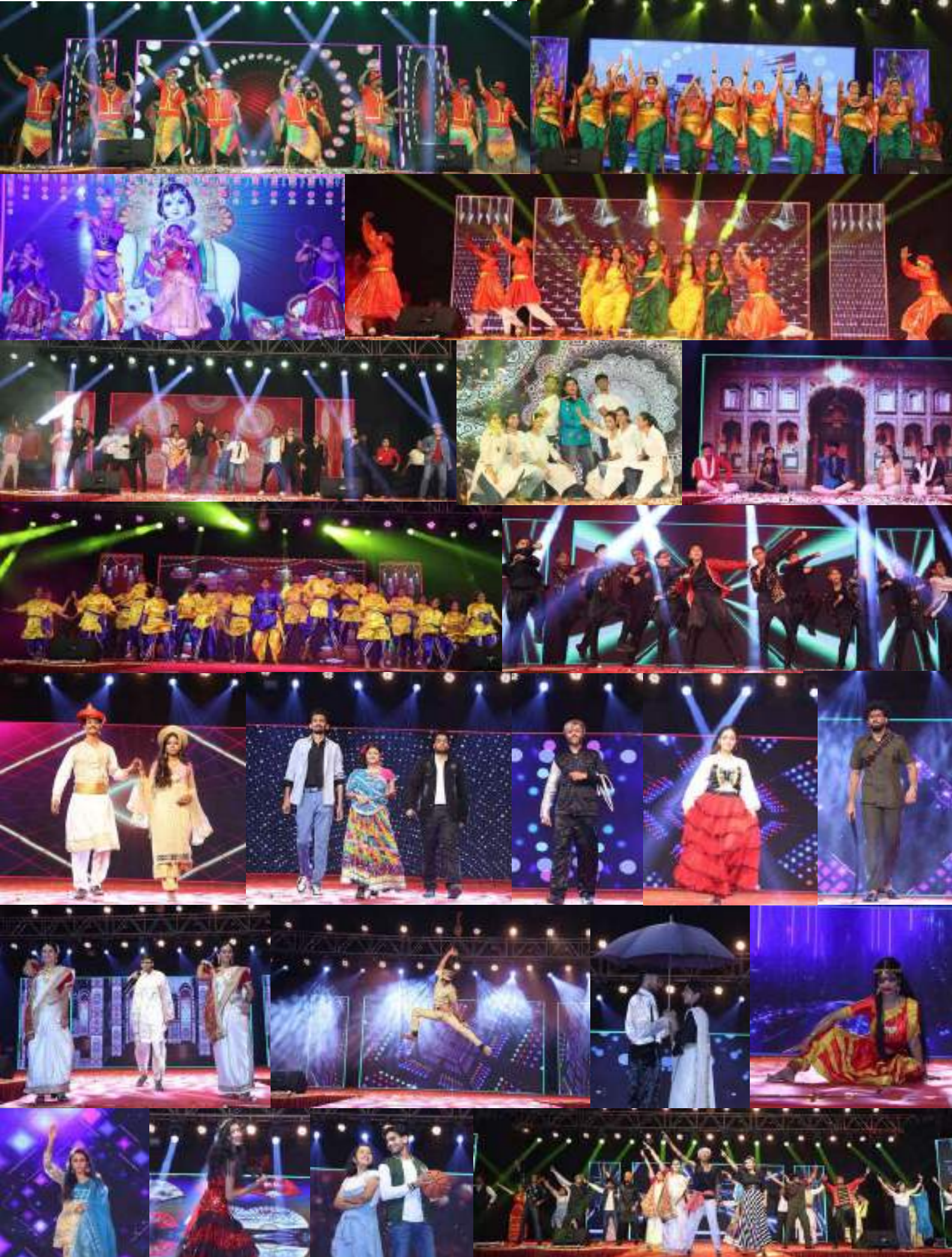
Students of KET's Schools of Management performed and participated in a fashion show, based on Bollywood, in keeping with the theme of the Cultural Evening - Mystical Mumbai. The performance that was a collage of diverse movies and genres, showcased the variety in Indian cinema. Kudos to the students for their stellar performances and to the KET team for giving the students a platform to showcase their talent!