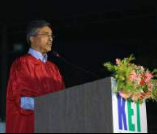
PGDM 2020 - 2022